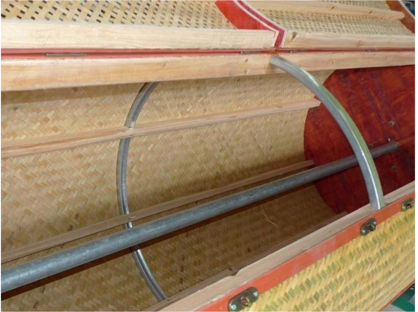
Steel tube and steel ring reinforcement design, the machine runs smoothly, and the body vibration is small.