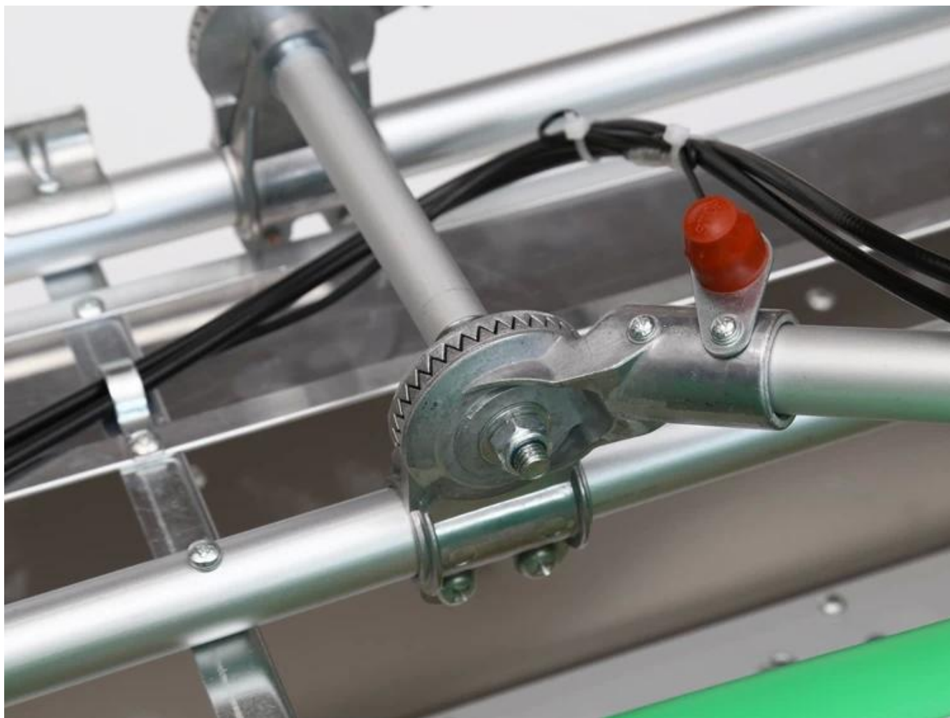
Gear type clasp design, high strength, not loose, tea picking process more relaxed